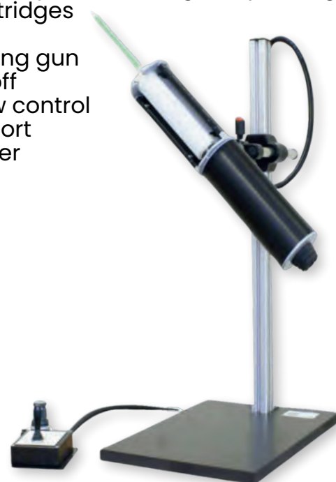
swivel facility to prime mixer

Polymer Systems Technology Limited Unit 2, Network 4, Lincoln Road, High Wycombe, Buckinghamshire, HP12 3RF, UK